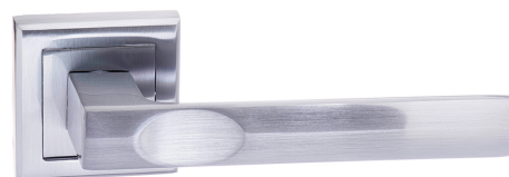
Product Finish Pictured: Satin Chrome